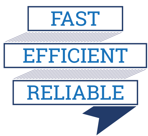
Figure 2: Best-in-Class Service Words

The financial professionals responding to the survey offered a wide range of words they associate with best-in-class service, including easy, innovative, and transparent. The three words mentioned more than others, however, were Fast, Efficient, and Reliable. These words were both among the three words offered by more than 10 percent of those surveyed, and most likely to be the first word entered. Speed, efficiency, and reliability are all improved by e-Capabilities, so small wonder so many say they would use annuities a lot more often if they had these capabilities for every transaction.