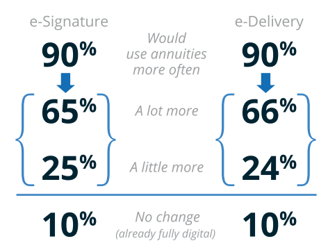
Figure 1: 100% Digital Experience = More Use of Annuities

The importance of implementing a 100% digital experience for annuities is underscored by these survey responses, especially the almost two-thirds of financial professionals who view a complete digital experience as resulting in them using annuities "a lot more." When transactions in other financial products like stocks, bonds and mutual funds are processed far more quickly and simply than annuities, it is imperative to move to a process that is smoother, more accurate, and faster.